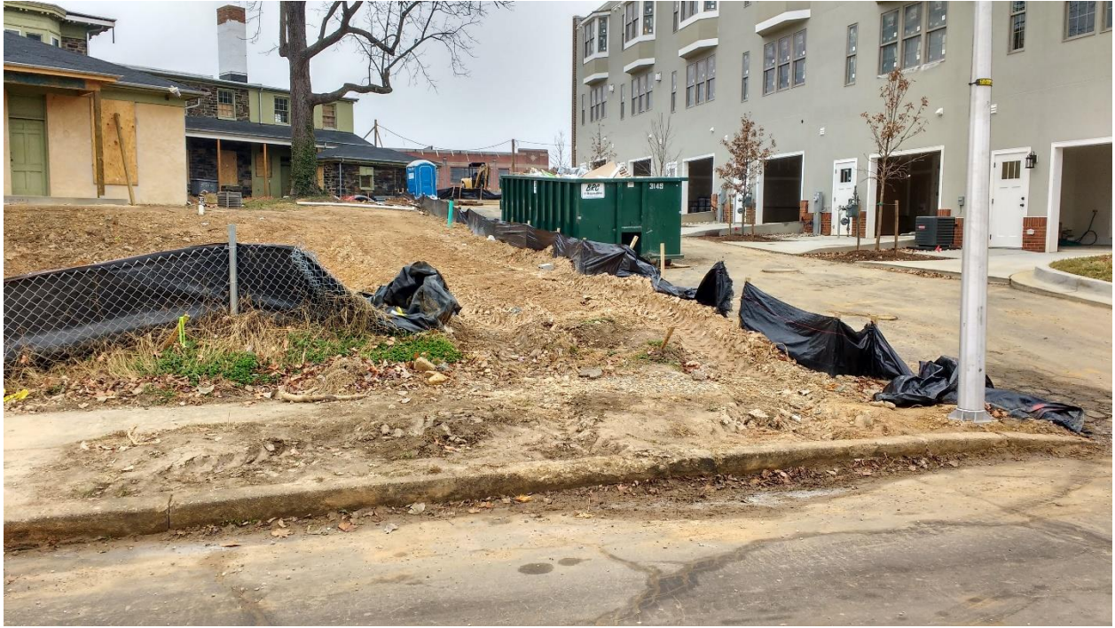
Ash Street, Baltimore Maryland